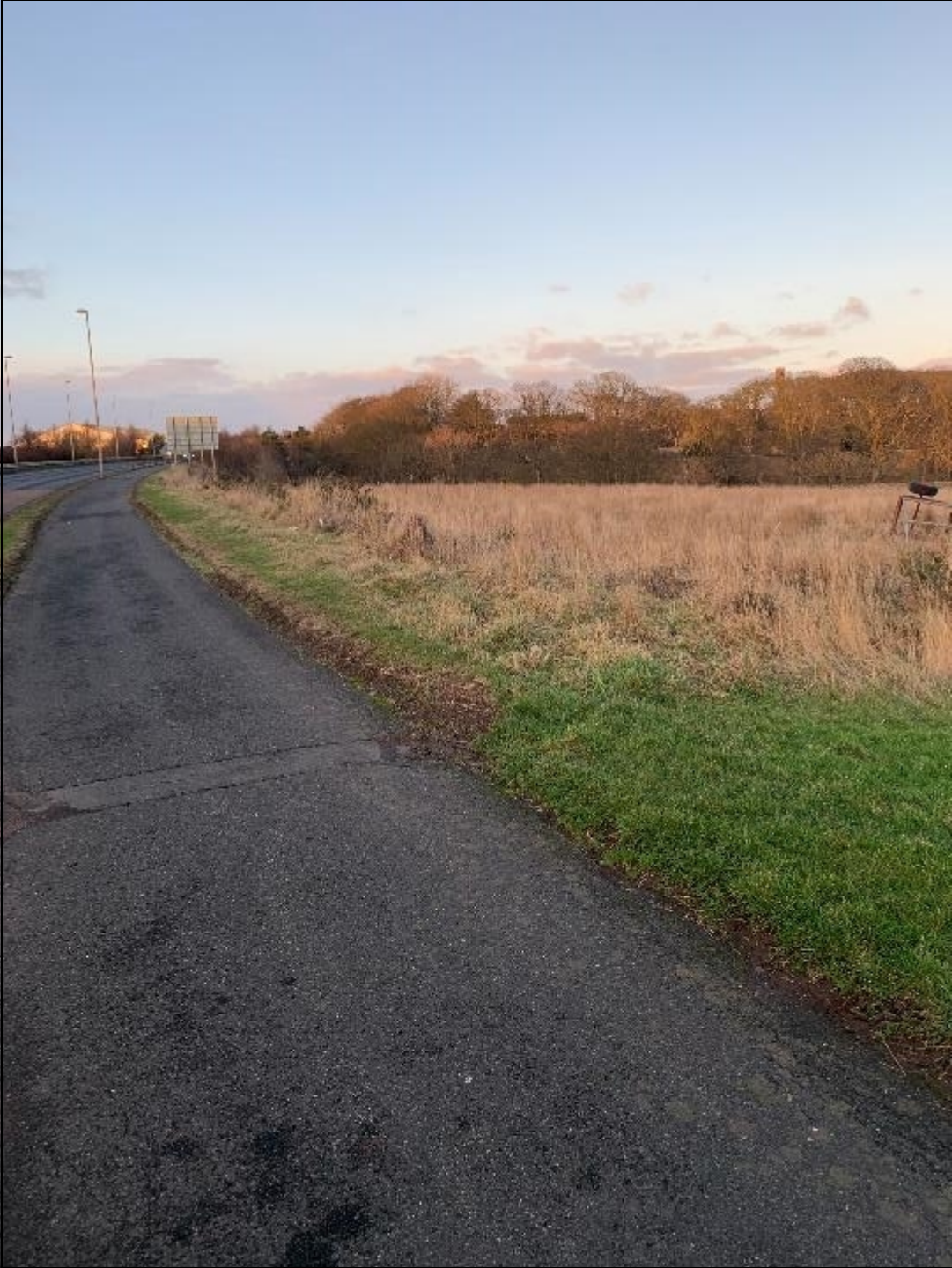
Western Boundary of Site