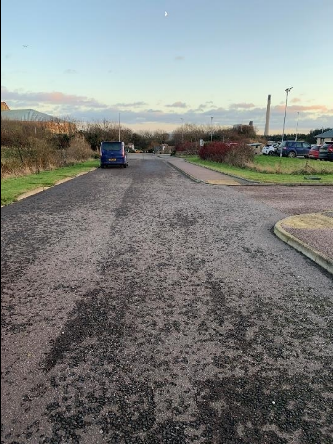
Existing Access Road Looking SE