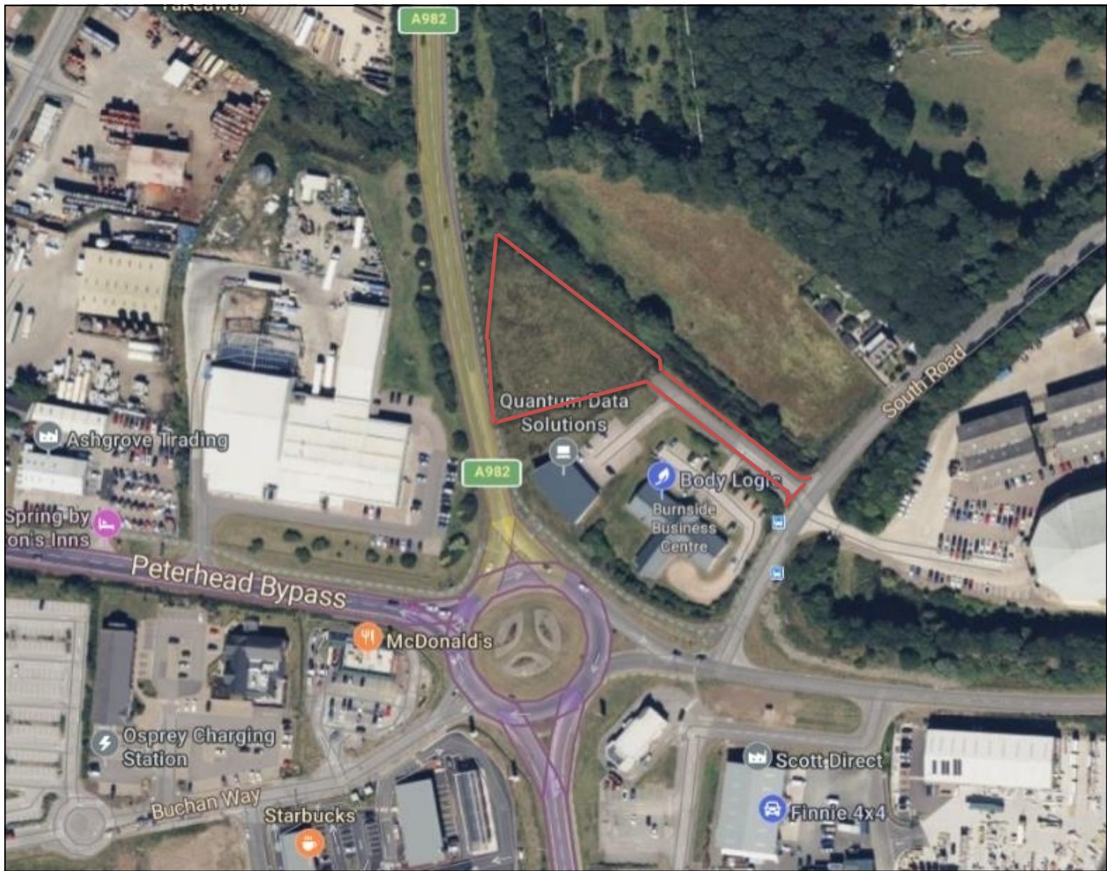
Approximate Application Site Boundary (red line)