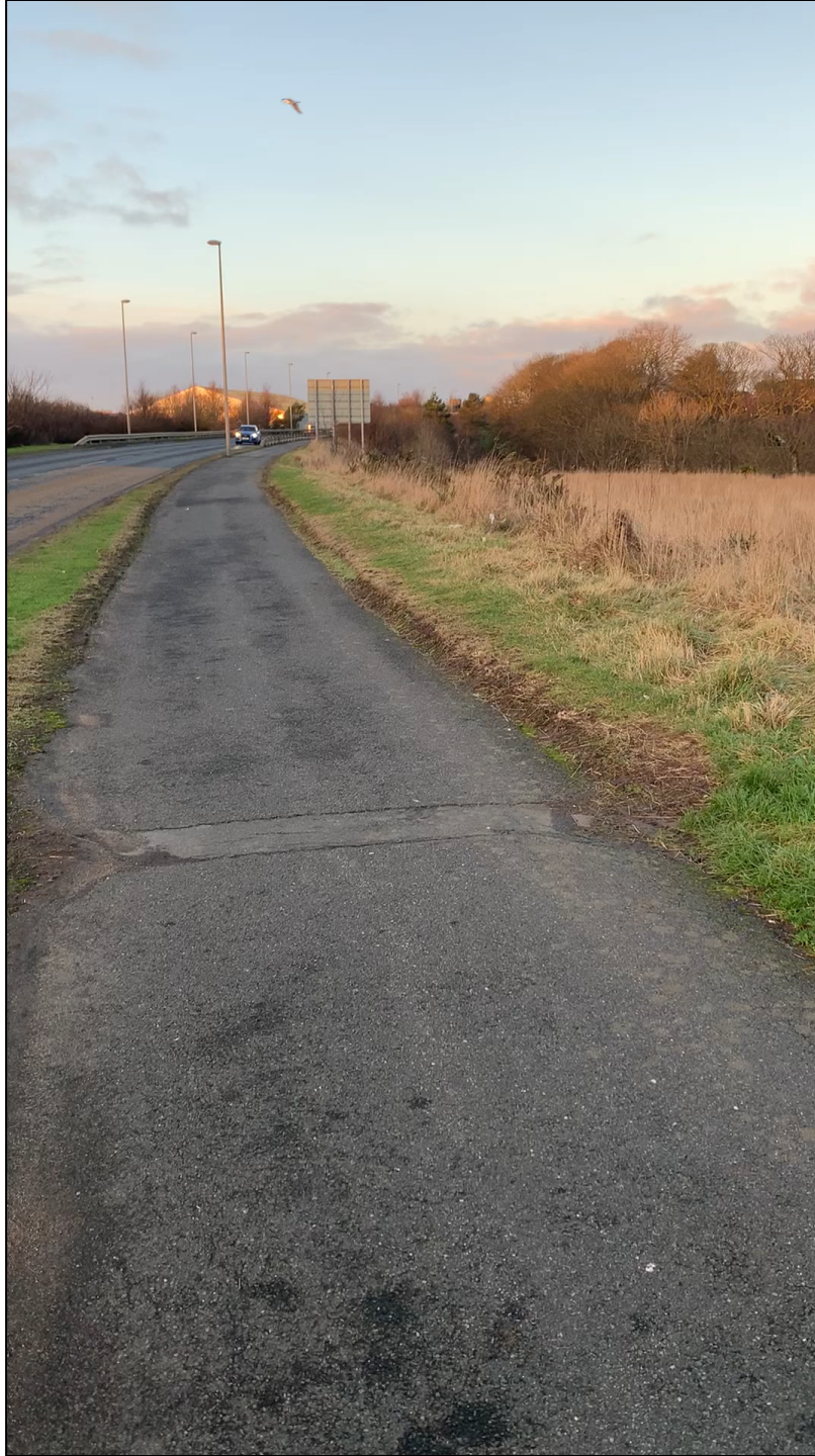
Site Video (view from SW Corner)